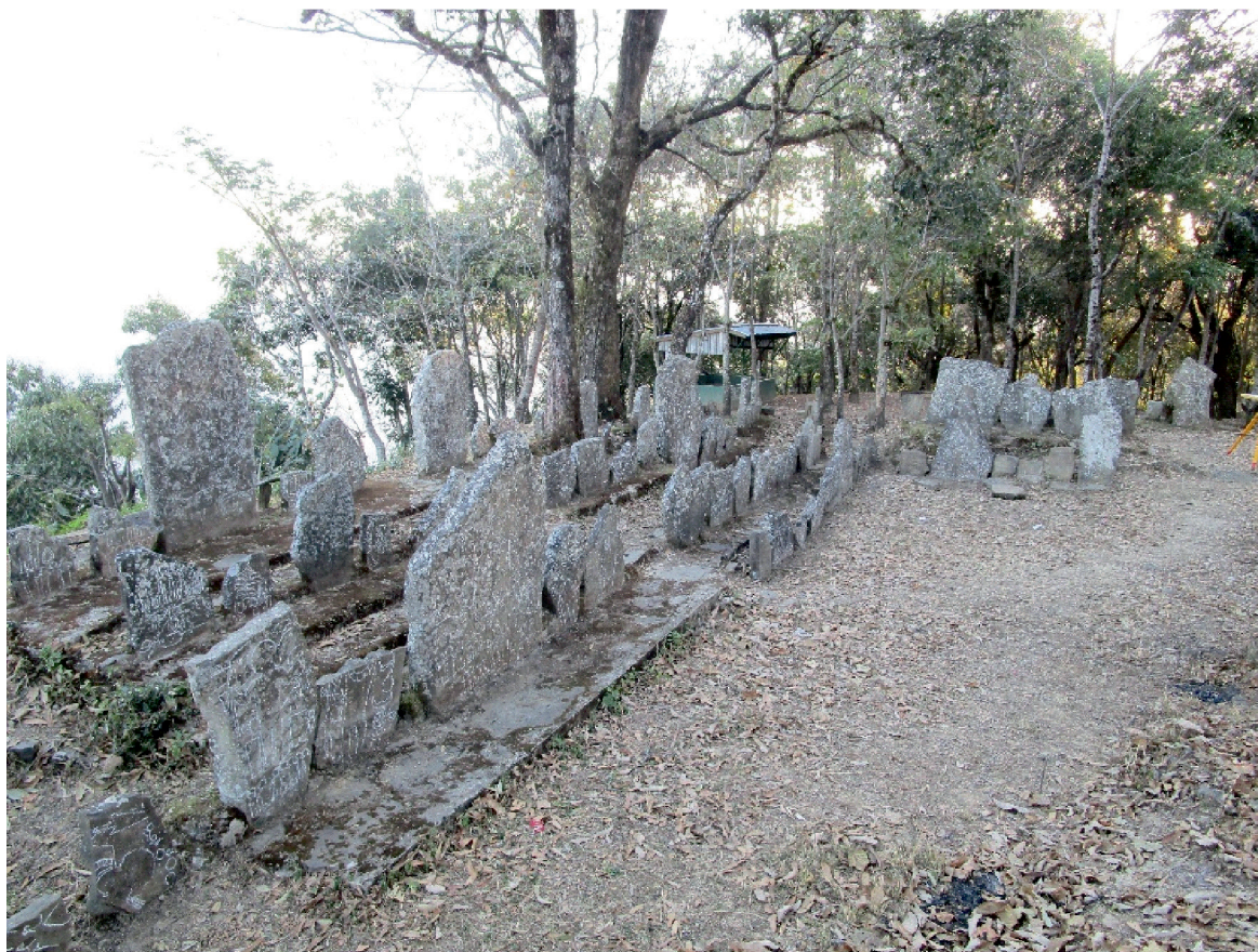
Fig. 1: Lianpui avenue

Lianpui (named after Lianpuia of Palian clan) has multiple archaeological sites distributed in various parts of the village. Known archaeological localities at Lianpui are Lungphunropui , a menhir avenue with multiple engravings (Fig. 1), pit/depression/posthole, and petroglyphs (Lalhminghlua, 2025). The known petroglyph is locally called as Lungziaktlang (N23.2449472, E93.3487556) with engravings on three slabs (Fig. 2 & 3) (Lalhminghlua, 2022). The newly discovered petroglyph (N23.24666, E93.34738) is located approximately one kilometre from the village at an elevation of 1375m above mean sea level. For the purpose of recording and classification, the authors have decided to name the newly discovered locality as Lungziaktlang 2 and the previously known petroglyphs as Lungziaktlang 1 . The distance between the two localities is approximately 230m on the southern side of the village. Both the petroglyphs are located above the present-day kaccha road going to Myanmar. The new locality is located closer to the village and was accidentally exposed in the course of quarrying by the locals.