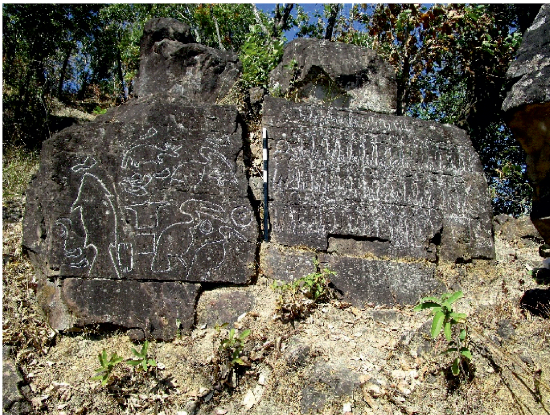
Fig. 2: Lungziaktlang 1 – Slab (1 & 2)