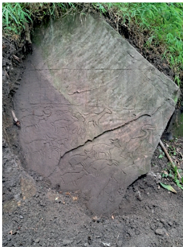
Fig. 7: Lungziaktlang 2 - Slab 2