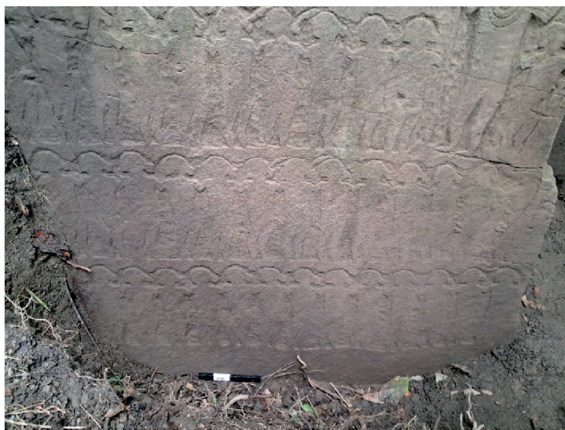
Fig. 6: Lungziaktlang 2 – Slab 1 – Human figure row 3 & 4 (Scale 20 cm)

The fourth row of human figures all have their hair depicted downward.