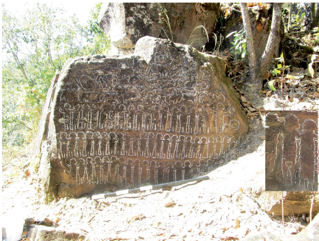
Fig. 3: Lungziaktlang 1 – Slab 3