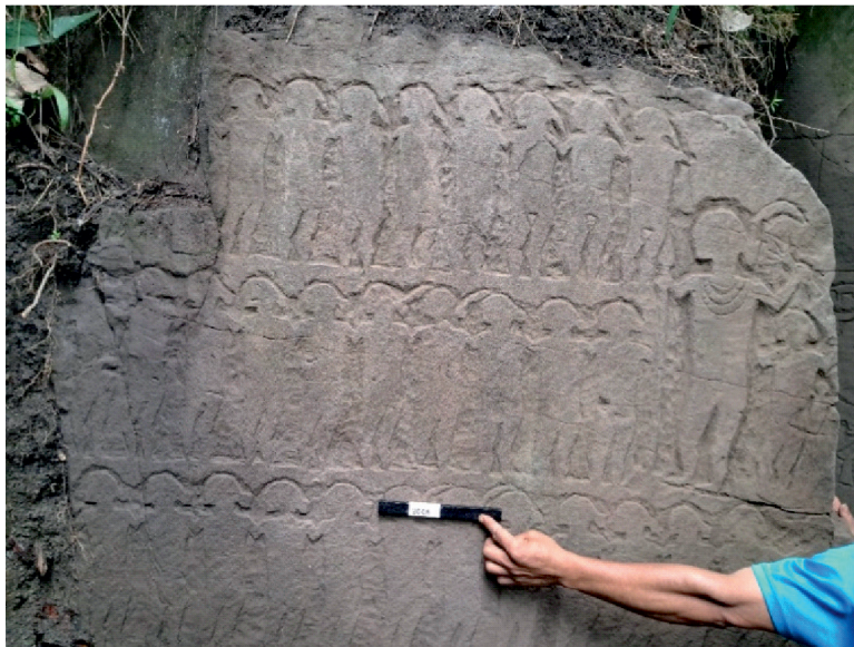
Fig. 5: Lungziaktlang 2 – Slab 1 – Human figure row 1 & 2 (Scale 20 cm)

The second row has thirteen human figures including one large figure considered as the prominent figure. The sixth and seventh figure in the middle and the prominent figure in the eleventh position are depicted with an upward headgear (counting from left to right).