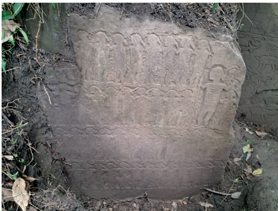
Fig. 4: Lungziaktlang 2 - Slab 1